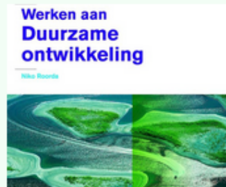
Werken aan Du. Ontwikk. (2007)