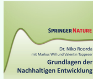
Grundlagen NE (Dez. 2020)