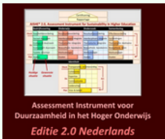
AISHE 2.0 Nederlands (2009)