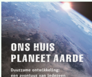
Ons Huis, Planeet Aarde (2008)