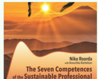
The 7 Competences (2018)