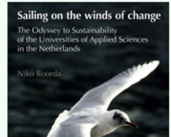
PhD Thesis (2010)