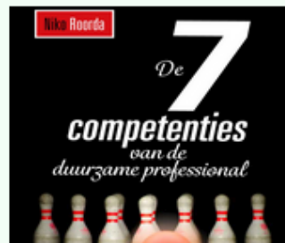
De 7 Competenties (2015)