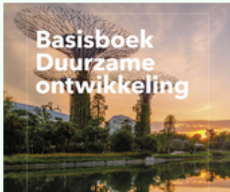
Basisboek DO (4e ed., 2020)