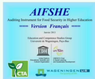
AIFSHE (Français, English)